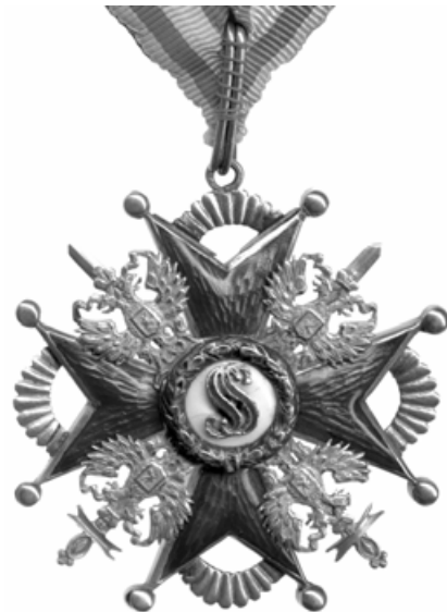
245 Order of St. Stanislaus , Military Division, 2 nd class neck badge, in gold and enamels (enamels on both sides), by Dmitri Osipov of St. Petersburg, circa 1900, the central medallion of unusual style with (on obverse) applied 'ss' monogram in gold and enamel within an enamelled silver wreath, 52 mm., minor loss to one eagle, very fine, mounted on a rosette-style riband for wearing from a button or stud, very fine £800-1,200